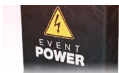
Temporary Power Systems