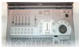
Video Broadcast Equipment