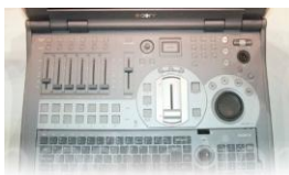
Video Broadcast Equipment