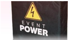
Temporary Power Systems